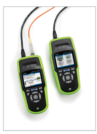
Left: LRAT-2000 / Right: LRAT-1000